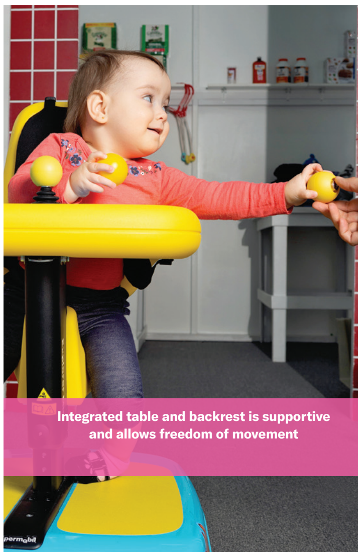
Integrated table and backrest is supportive and allows freedom of movement