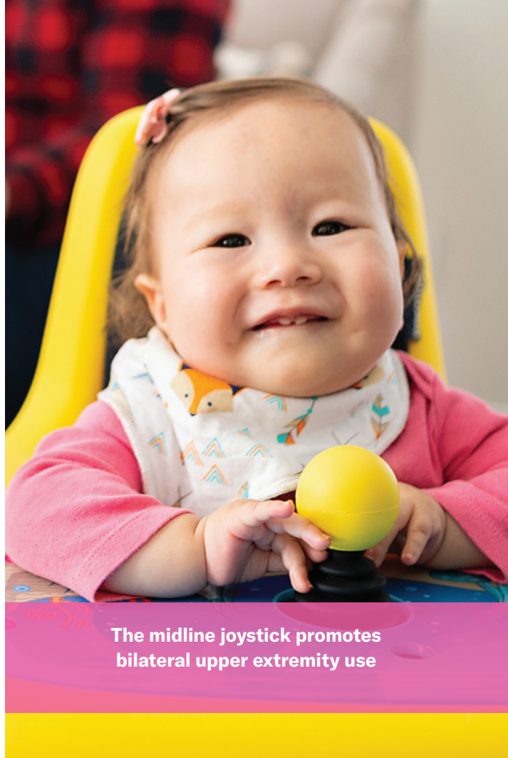
The midline joystick promotes bilateral upper extremity use